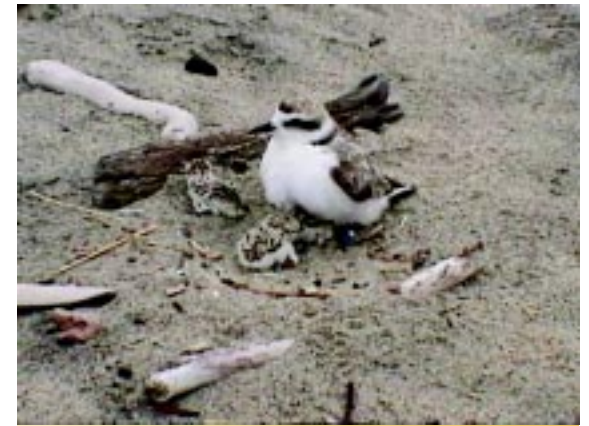
Adult and chicks

Plovers can be found on flat, open coastal beaches in dunes, and near stream mouths. They are well-camouflaged and extremely hard to see, often crouching in small depressions taking shelter from the wind. California State Parks beaches provide much of the suitable habitat remaining in California for this small shorebird.