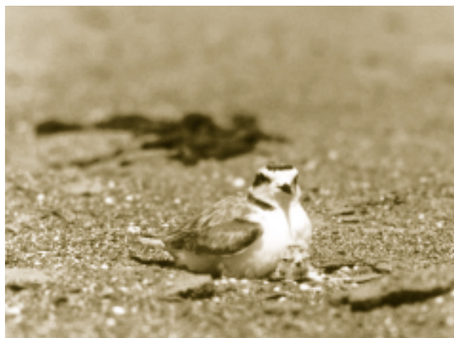
Adult on nest

With California State Parks' efforts and your active cooperation, we can make a difference in the survival of the western snowy plover on California beaches.