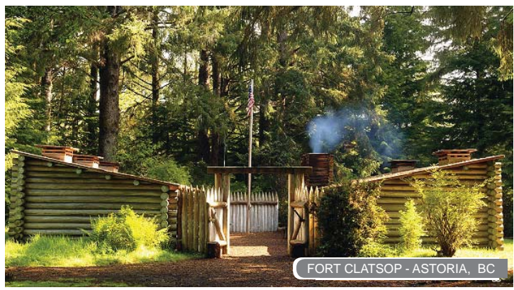
FORT CLATSOP - ASTORIA, BC

We will tour the city en route to the Royal British Columbia Museum which includes the Natural History Gallery. This museum also contains an IMAX theatre. In the afternoon, we will visit Goldstream Provincial Park known for its annual salmon run and large numbers of bald eagles – a perfect place for birders and photographers. If you choose, hike to spectacular Niagra Falls. Evening lecture by Rouvaishyana, California State Park Interpretive Specialist. (B,D)