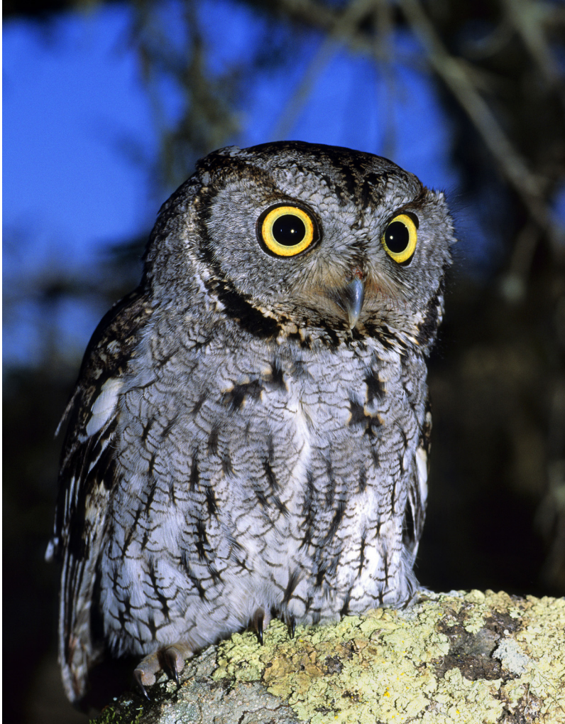
Western Screech Owl, Los Osos Oaks Reserve