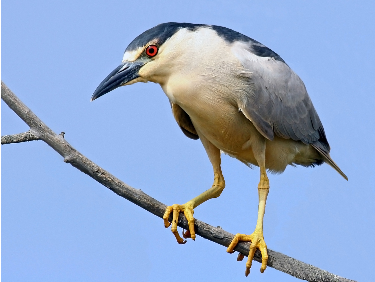
(some branches were removed using Photoshop)